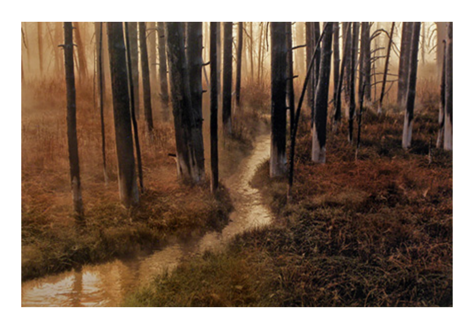
"Misty Woods", by James Weidenfeller, Hocomock Camera Club Connecticut Association of Photographers Medal (Best Color Landscape Print) Best of Show (Best Color Print in Conference Competition)