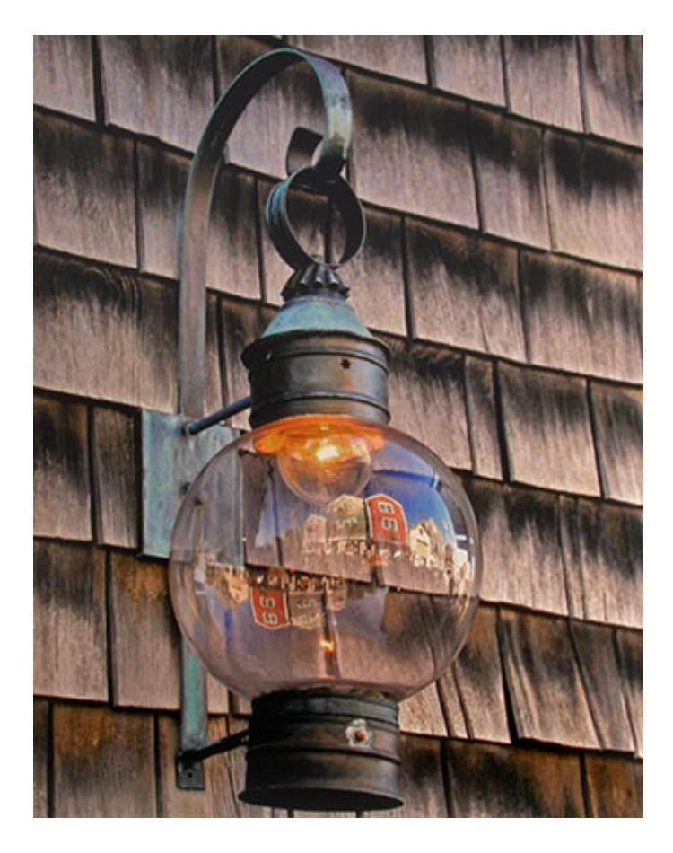
"Reflections of Rockport", by Kathy Buckard, Photo Adventures Camera Club Connecticut Association of Photographers Medal (Best Color Creative Print)