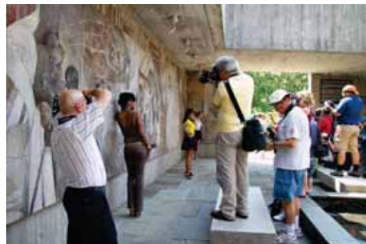
Model Shoot at Conference

These are just two of the many things I found and learned at this conference. I hope to attend next year, as it really was an amazing experience.