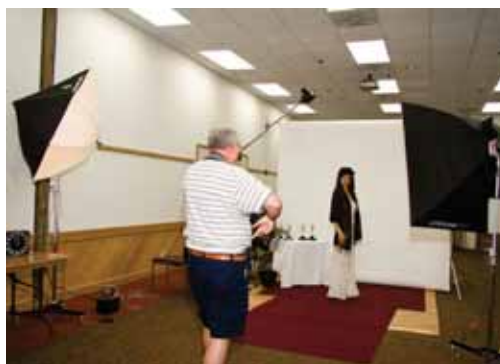
Attendee photographing a model