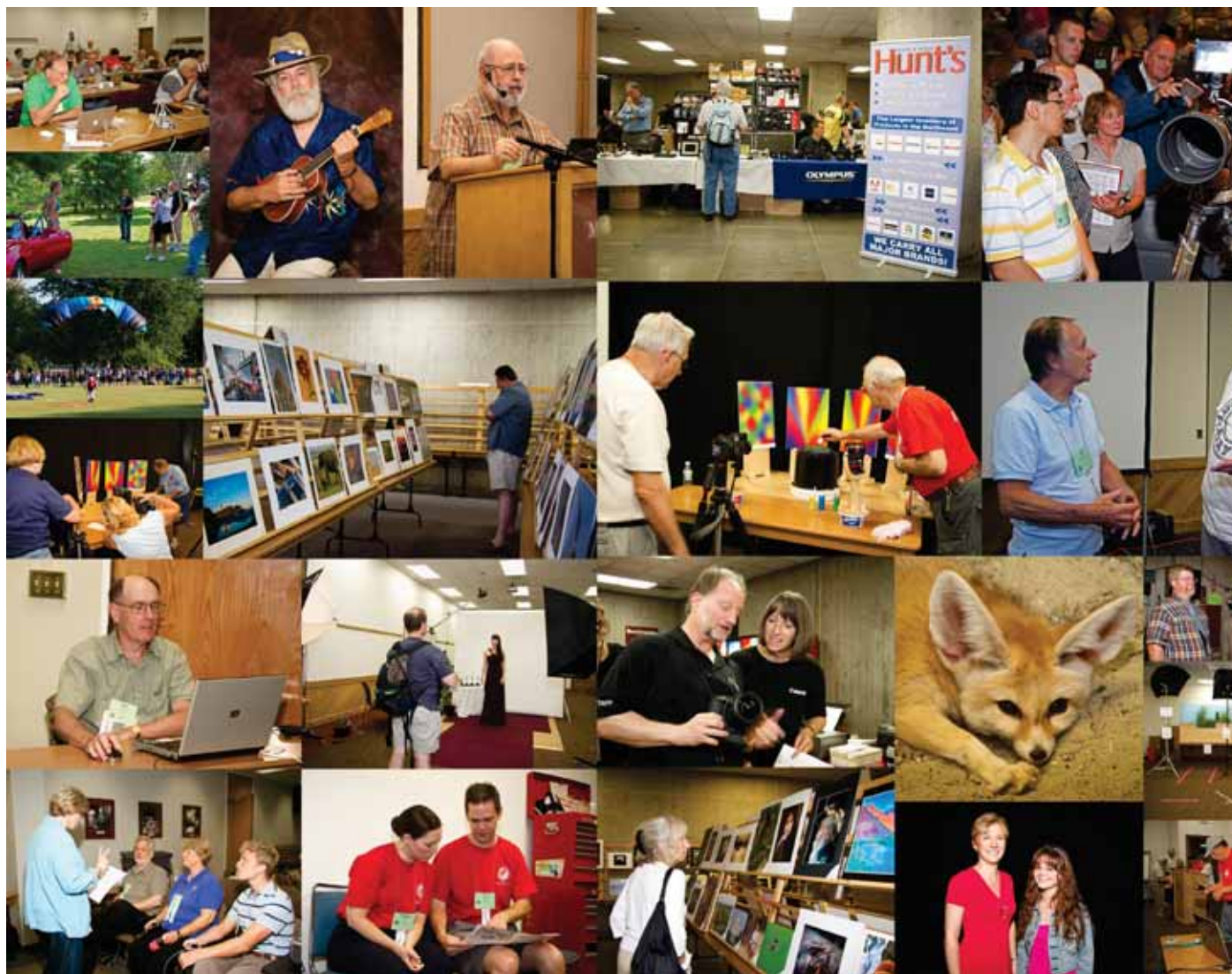
Conference Photo Collage