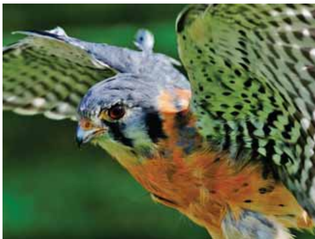
Best of Show - American Kestrel by Bert Schmitz, Housatonic Camera Club (CT)