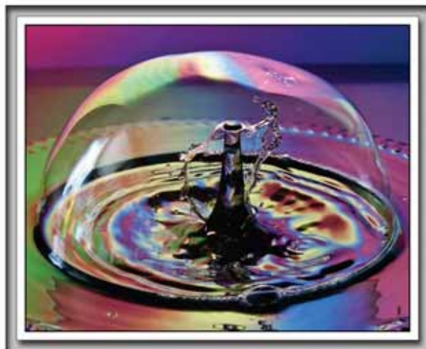
Best Creative - Drop in Bubble by Roy Marshall, Cranberry Country Camera Club (MA)