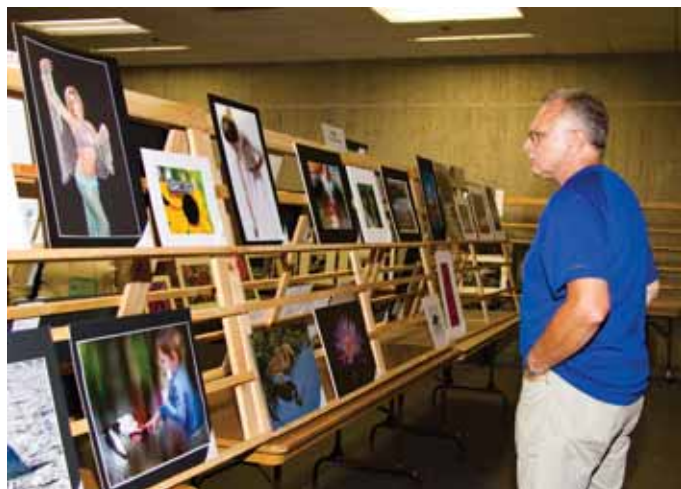
Checking the photographs in the Print Room