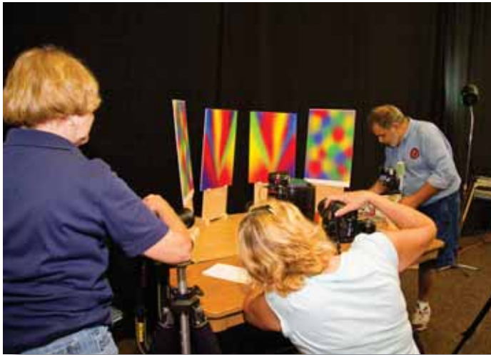
High Speed Photography Setup