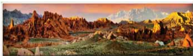
Judge Paul Hassell's Choice - Sundown on the Desert by Chuck Skipper, Southtowns Camera Club (NY)