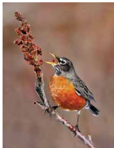
Class B "American Robin Feeding on Sumac"