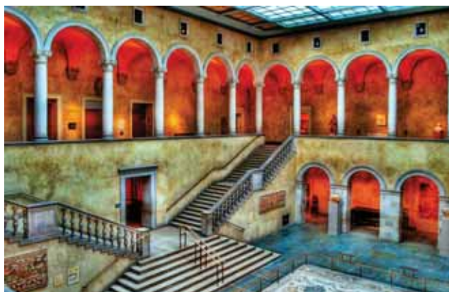
Class B "Renaissance Court" by Dan Clendenin Camera Club of Central New England