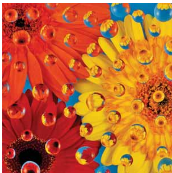
Best of Show - Floral Drops by Christina Richardson, Photographic Society of Rhode Island