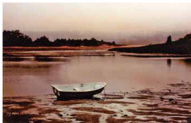
CAP Gold Medal for Best Color Seascape - Cape Cod Morning, by Cal Ellinwood, Cape Cod Viewfinders