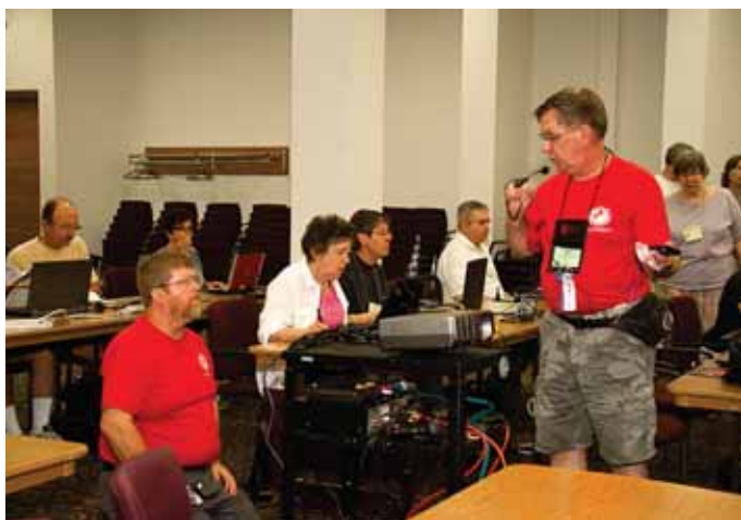
Dquiptment crew setting up Photoshop class