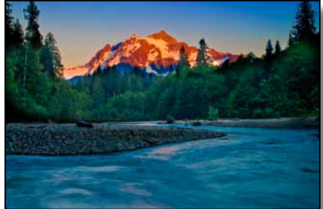
Mt Shucksan Sunset