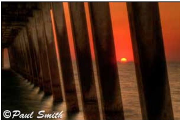
Venice Pier (Florida) 5 shot HDR Image

There are some scenes that are too high in contrast to capture with just one frame. High Dynamic Range (or HDR for short) imaging solves that problem. By photographing that scene with bracketed exposures, there is now software available that will combine those bracketed frames to give you 1 frame where there is detail in both the highlights and shadows.