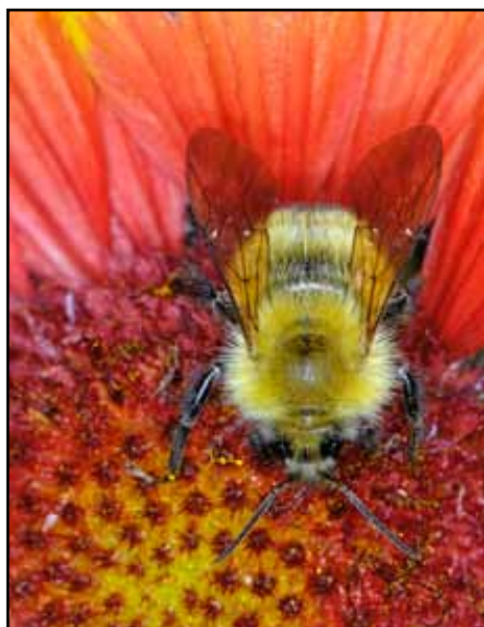
Spring Color Prints, 1st place "Pollen Collector" by Dan Champagne, Castle Craig CC