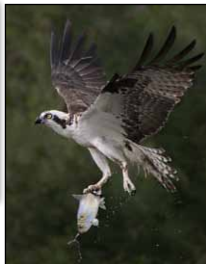
Winter Nature Electronic Imaging, Class A, 1st place "Osprey No. 4" by Bill Low, Cape Cod Viewfinders CC