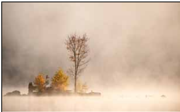
Winter Color Prints 1st - "Tree Island In Deep Fog" by Lori Rha, Norwalk CC