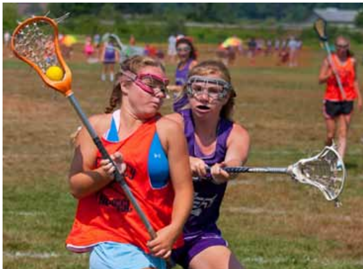
Lazers vs Upper Valley