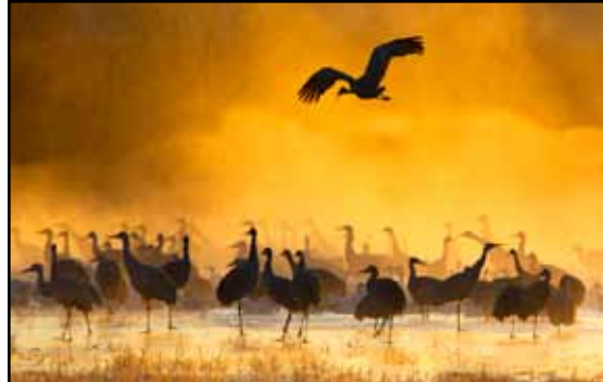
NECCC Gold Best New England Entrant "Bosque Morning" Frank Forward Sherborn, MA Boston West Photographic Society