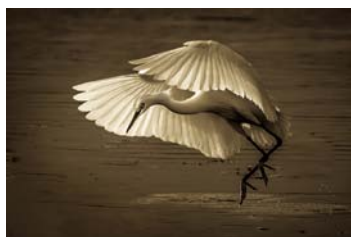
Sandee Harraden Quinebaug Valley PC Fly Fishing