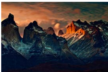
Los Cuerno