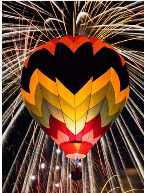
"Bursts of Light"