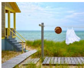
Nancy Bloom Cape Cod Art Association Laundry Day