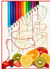
Eileen Doherty Westfield CC The Colors Of Fruit