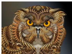
Pam Hastings Charter Oak CC Elegant Feathers