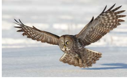
HA - Great Gray in Flight - Peter Curcis