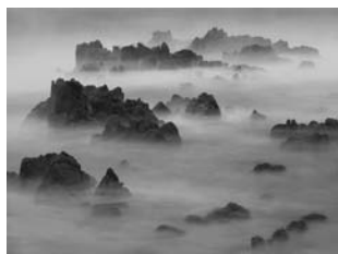
Paul Osgood Simsbury CC Asilomar Beach