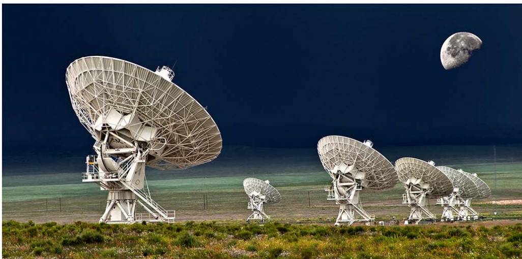
"Listening to the Cosmos"