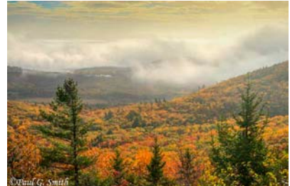
View ascending Cadillac Mt.