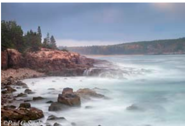
Park Loop Road