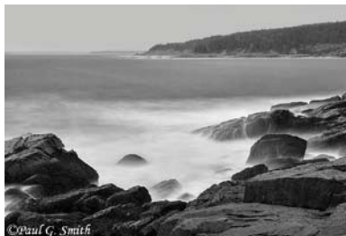
Park Loop Road