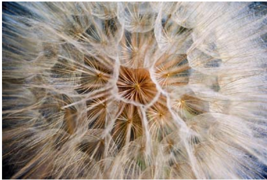
Kathryn Evans Starflower Best Botany Hockomock Digital Photographers