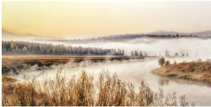
“Fog Cloud Upriver” , by Beth Fabey , Bowie-Crofton Camera Club Award: Connecticut Association Of Photographers Medal (Best Color Landscape)