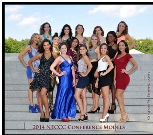
The 69th Annual Conference models.

I look forward to another successful year working with the NECCC officers and all of you. Please feel free to contact me with questions and/or suggestions. You can reach me at NECCC2014@comcast.net