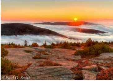
Sunset from Cadillac Mt