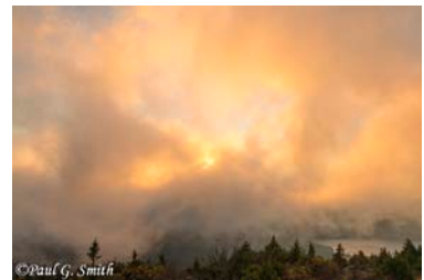
Fog and Sunset