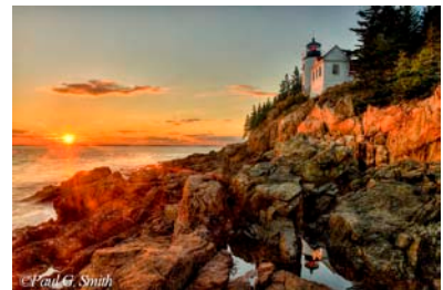
Bass Harbor Light House