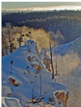
Irwin Nesoff Yellowstone Sunrise Best Landscape South Shore Camera Club (NY)