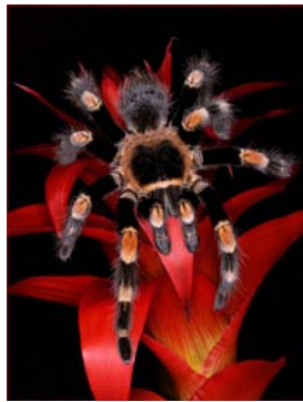
Lorraine Piskin Tarantula Best Wildlife Huntington Camera Club