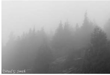
Shrouded in Fog, Cadillac Mt.