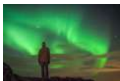
LIGHTROOM AND DIGITAL WORKFLOW