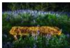
LIGHT PAINTING/ LIGHT DRAWING